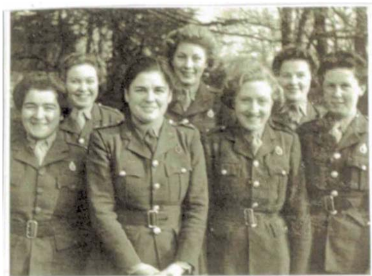
Signals Office Staff at HQ 1943

The 'flash' on my right sleeve had a red background with a black witch on a broom stick. Motto "We sweep the skies"