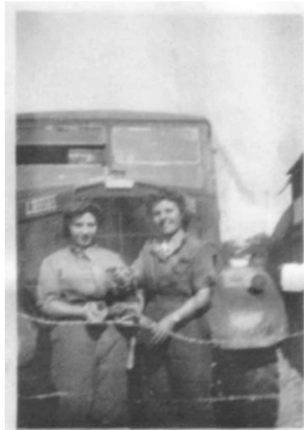
TSM Lorry – which was used to generate the power for the Searchlight till we got the Lister