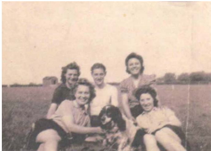
We had just done PE The fellow is the electrician who would come on site when needed