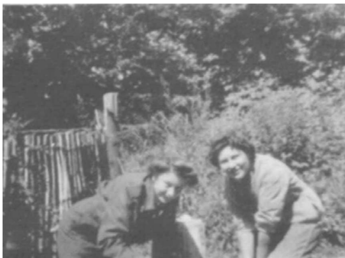
Cleaning out the cess pit