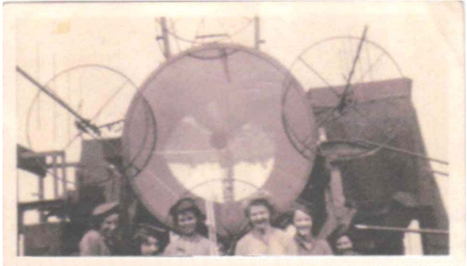
150 cm Searchlight with radar