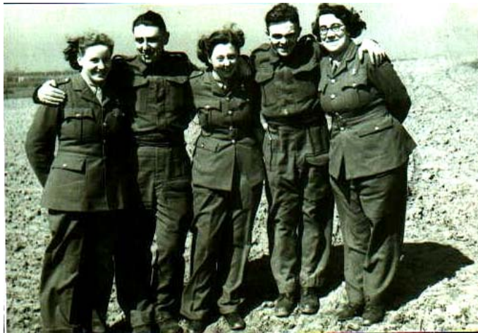
Girls from the radar team with some male gunners