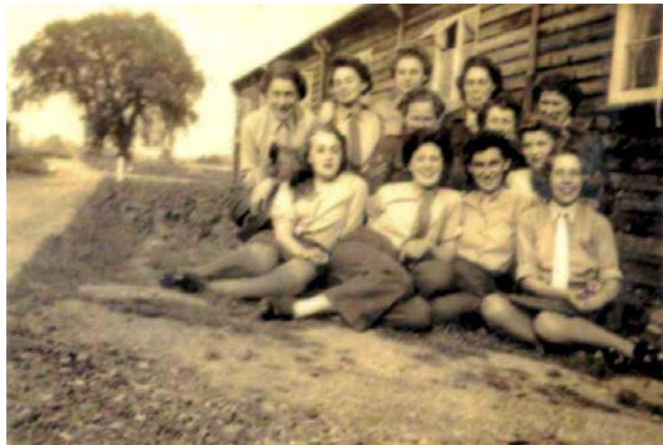
My fellow N.C.O.s, Oswestry