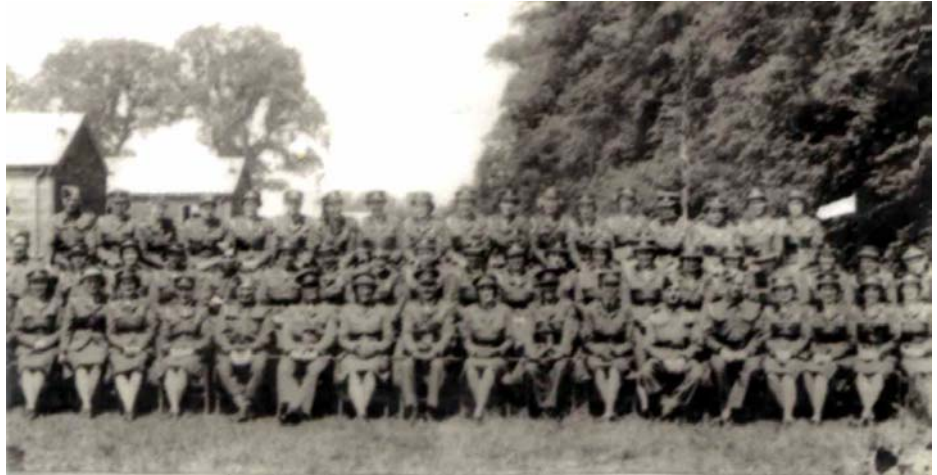
1 st Mixed Radar Regiment, Royal Artillery